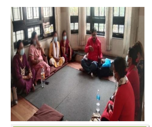
SWC Evaluation Team meeting with SETU Beneficiaries