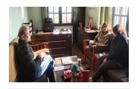
Meeting with Stakeholders (CECI team)